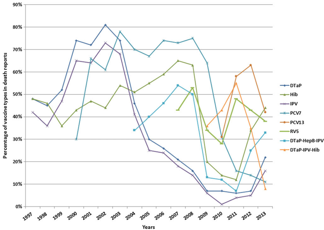
Figure 2. Trends in death reports by vaccine type in children aged 0–17 years, Vaccine Adverse Event Reporting System, 1 July 1997–31 December 2013. Only the most common vaccines associated with death reports are shown. Vaccines shown may be given alone or with other vaccines and may be single or combined antigen vaccines, so percentages of death reports in any given year may exceed 100%. Abbreviations: DTaP, diphtheria, tetanus, and acellular pertussis vaccine; DTaP-HepB-IPV, combination diphtheria, tetanus, and acellular pertussis, hepatitis B, and inactivated poliovirus vaccine; DTaP-IPV-Hib, combination diphtheria, tetanus, and acellular pertussis, inactivated poliovirus and Haemophilus influenzae type b conjugate vaccine; HepB, hepatitis B vaccine; Hib, Haemophilus influenzae type b conjugate vaccine; IPV, inactivated poliovirus vaccine; PCV7, 7-valent pneumococcal conjugate vaccine; PCV13, 13-valent pneumococcal conjugate vaccine; RV5, rotavirus vaccine (pentavalent).

of life. HepB vaccine was the second most common vaccine associated with death reports. A previous study investigated neonatal death reports submitted to VAERS after HepB vaccine during 1991 through 1998 and did not find any safety pattern of concern [24], and a population-based study did not find a significant difference in the proportion of HepB-vaccinated (31%) and -unvaccinated (35%) neonates dying of unexpected causes [25].